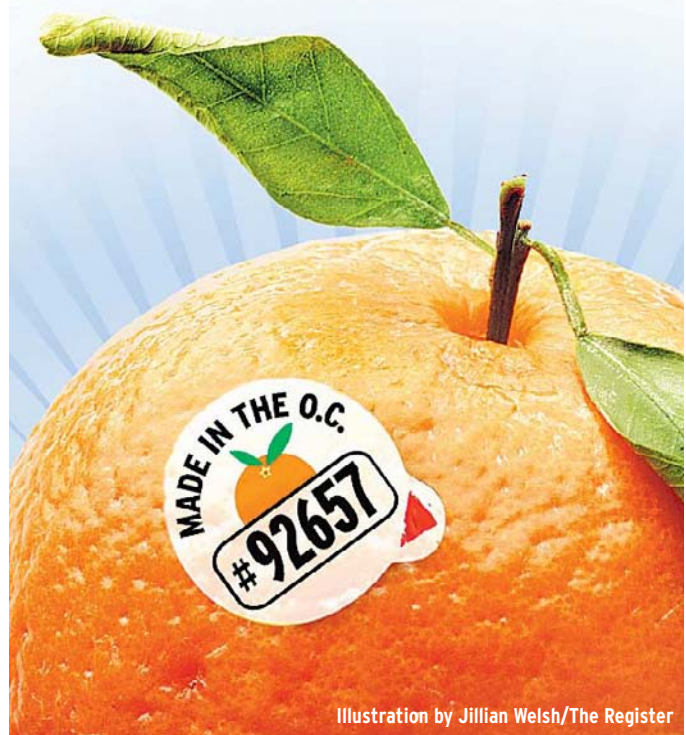
Illustration by Jillian Welsh/The Register