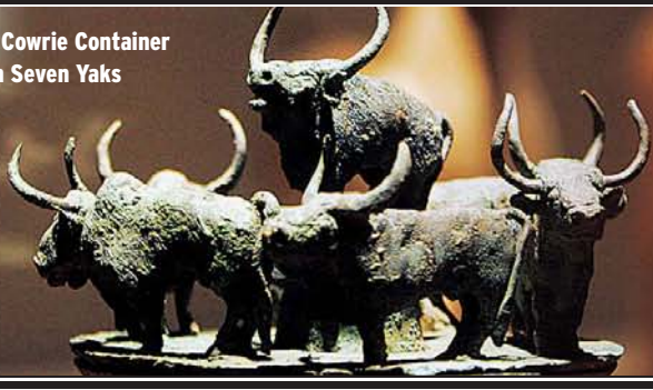
The Cowrie Container With Seven Yaks